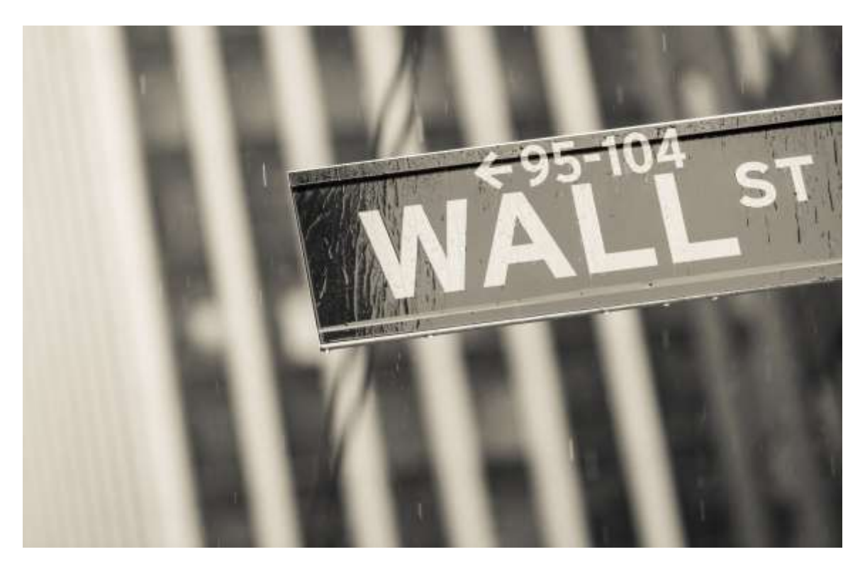
The U.S bank lending environment is currently robust but navigating the loan application process is not straightforward. Here is an outline of the lending landscape, some key elements of the process and possible post-closing requirements.

The U.S. banking world has highly sophisticated lending operations that are governed by the Federal Reserve Bank and the Federal Deposit Insurance Corporation (FDIC). In acquisition transactions the lender will usually perform a thorough and detailed underwriting of both the business to be acquired and the acquirer. U.S. banks tend to want a relationship that will continue after the loan is made, and are likely to require the acquirer to sign on for further banking services.