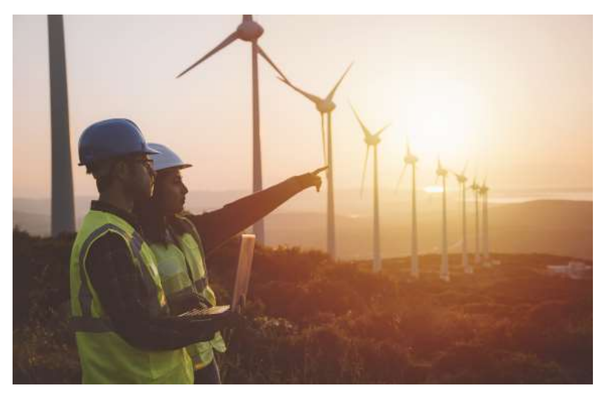
Lack of clarification around the real estate taxation rules for wind power plants in Poland means continued uncertainty for investors.

Real Estate Tax (RET) is payable on construction structures (or their parts) and is a significant cost factor that affects the profitability of wind farm investments in Poland. As a rule, the tax rate is 2%. However, complexities arise in the case of a wind farm as to whether RET applies to the whole wind farm or just part of it.