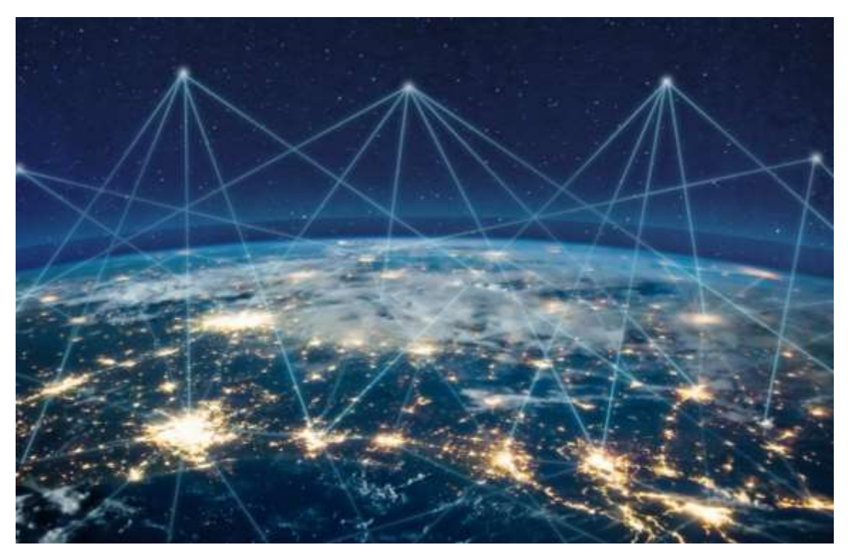
The definition of cryptocurrency and how it should be taxed varies widely among different tax authorities around the world.

With a lack of consensus on the nature of cryptocurrency, tax and revenue authorities in different countries have had to take a stand and issue guidance on their own official position on what it is and how it should be taxed.